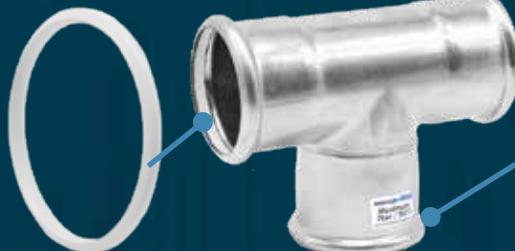
White STEAM Seal

Stainless Grade 316 Pressure Rating 7 bar -20°C / +165°C