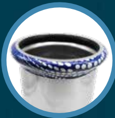
316 BLUE PRESS SLEEVE