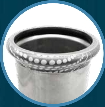
304 GREY PRESS SLEEVE