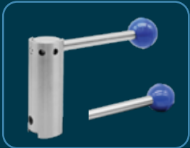
Extension Handle and Knobs