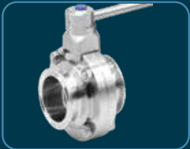
Tri Clover Ends