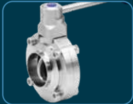
Butt Weld Ends