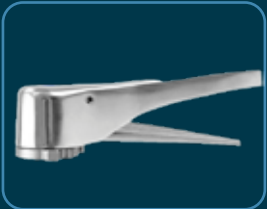
Butterfly Valve Handle